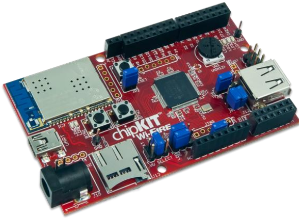
The chipKIT Wi-FIRE board.